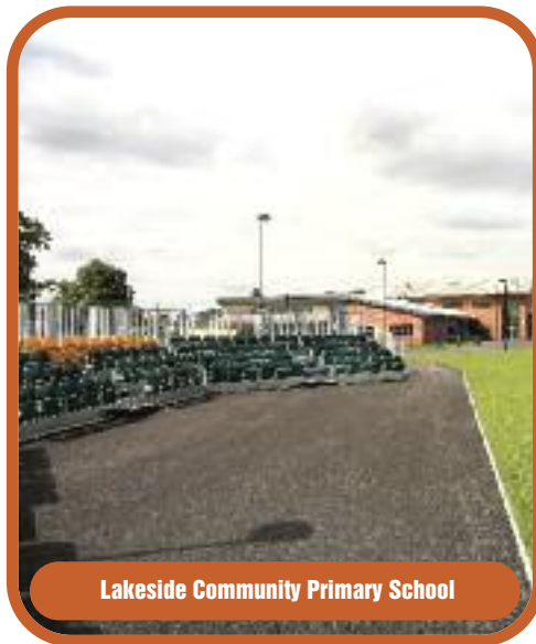
Lakeside Community Primary School