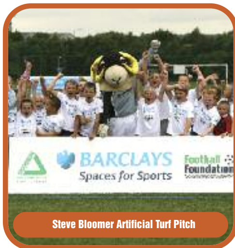
Steve Bloomer Artificial Turf Pitch

Prices in this brochure are correct at the time of going to print but may be subject to change.