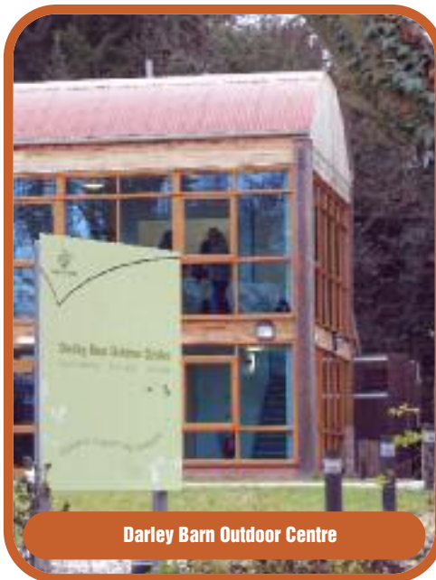
Darley Barn Outdoor Centre