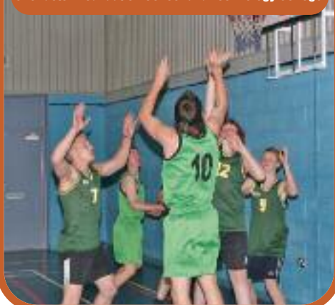
Chellaston Foundation School and Technology College

* please see page 21 for information about VAT and pricing