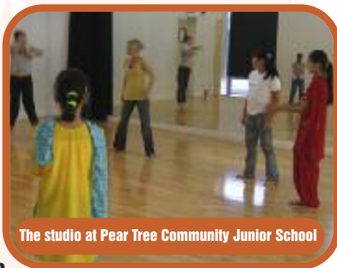
The studio at Pear Tree Community Junior School